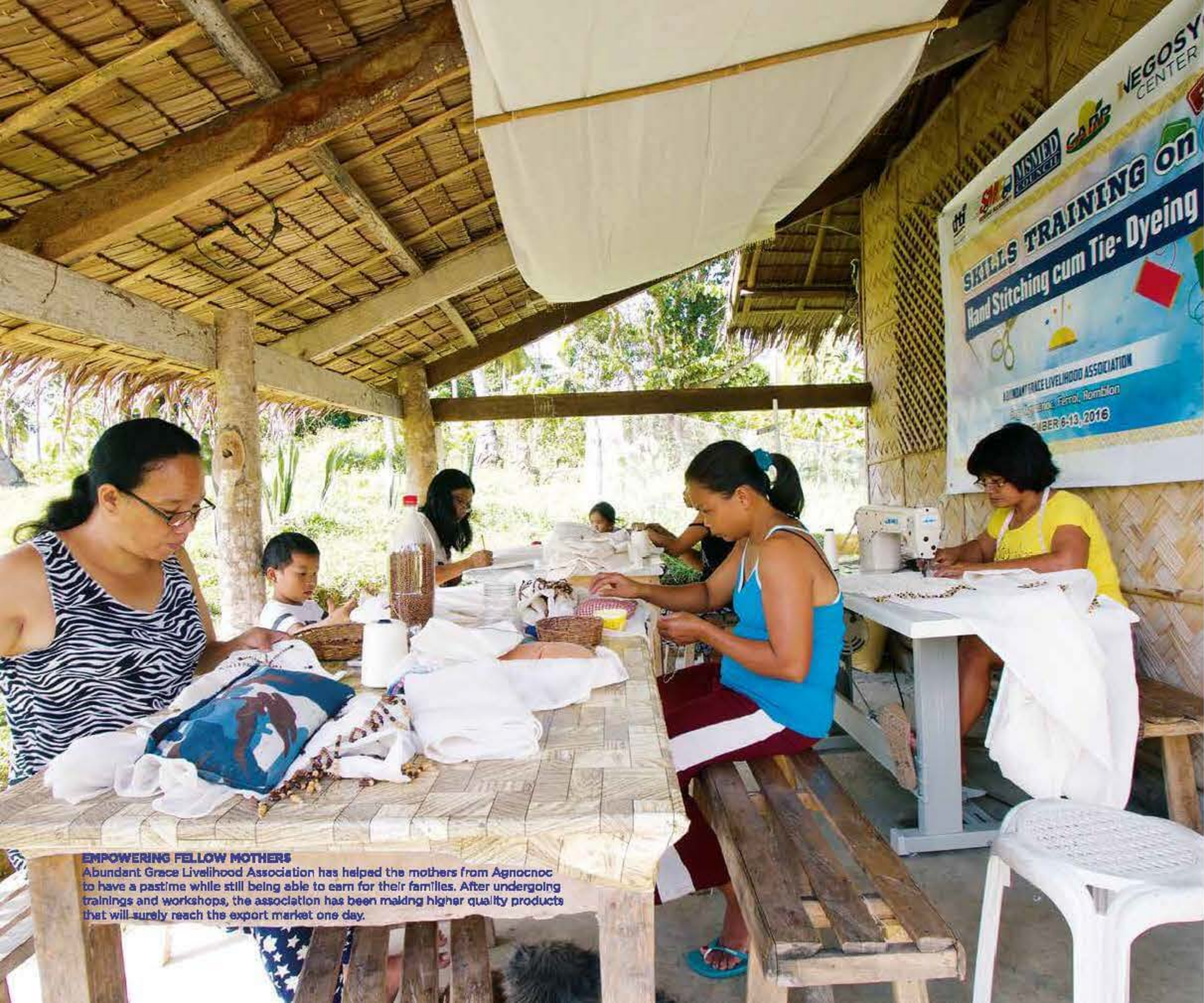
EMPOWERING FELLOW MOTHERS Abundant Grace Livelihood Association has helped the mothers from Agnocnoc to have a pastime while still being able to earn for their families. After undergoing trainings and workshops, the association has been making higher quality products that will surely reach the export market one day.