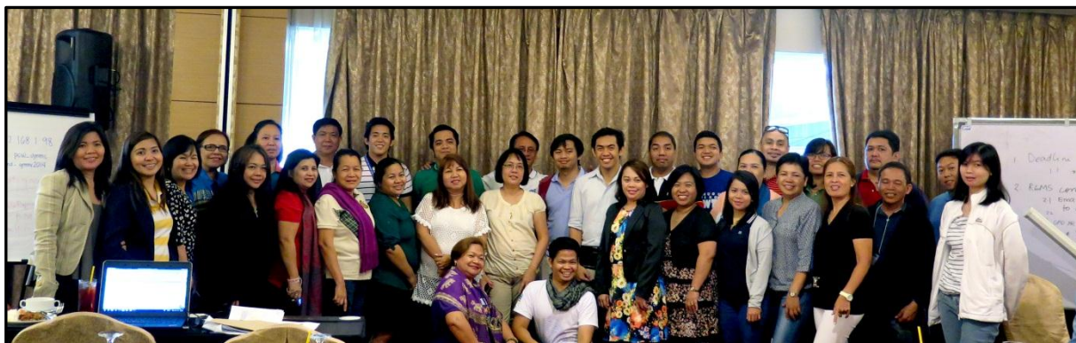
DTI-Head Office GAD Representatives discussed various GAD-related topics such as plan, budget, and the current situation or gender equation at the Focal Point Assembly.

This was followed up by RGMS' organized Gender and Development (GAD) Focal Point Assembly on 16 – 18 March 2016 at the Ace Hotel and Suites, Pasig City. In the assembly, they discussed the Department's GAD strategy within the DTI mandate.