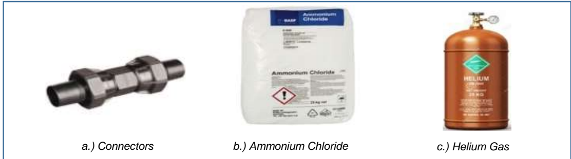
Fig 1. Example of unlisted dual-use items that may be subjected to CAC a.) connectors or plugs if used in a nuclear reactor to produce plutonium; b.) ammonium chloride used to make missile propellant, and c.) helium gas used to dilute uranium hexafluoride gas for uranium enrichment.