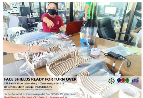
FACE SHIELDS READY FOR TURN OVER SSF Fabrication Laboratory – Zamboanga del Sur JH Cerilles State College, Pagadian City To be donated to Zamboanga del Sur COVID-19 frontliners. Shared Service Facility Project of DTI Region IX – Zamboanga del Sur