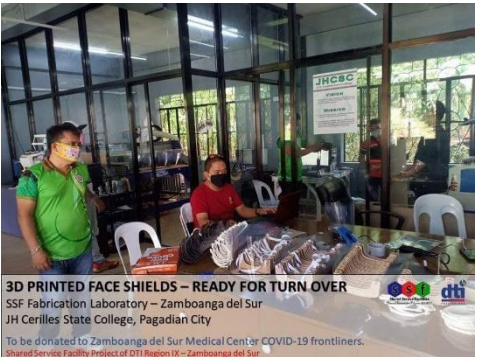
3D PRINTED FACE SHIELDS – READY FOR TURN OVER SSF Fabrication Laboratory – Zamboanga del Sur JH Cerilles State College, Pagadian City To be donated to Zamboanga del Sur Medical Center COVID-19 frontliners. Shared Service Facility Project of DTI Region IX – Zamboanga del Sur