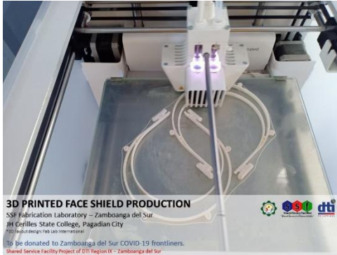
3D PRINTED FACE SHIELD PRODUCTION SSF Fabrication Laboratory – Zamboanga del Sur JH Cerilles State College, Pagadian City To be donated to Zamboanga del Sur COVID-19 frontliners. Shared Service Facility Project of DTI Region IX – Zamboanga del Sur