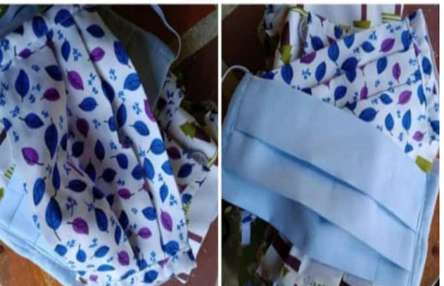
Some MSMEs from Batanes accept orders online.

For sale face mask 35 only..hand made by Amor Gonzales #Support local 🍌🍌🍌🍌🍌