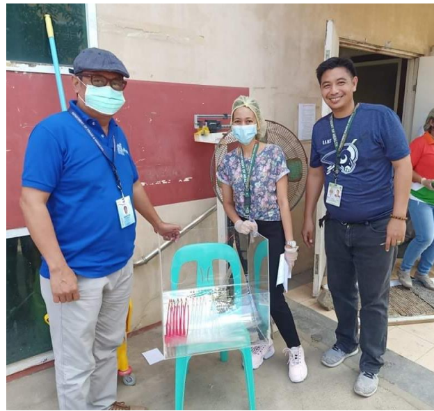
PD Singun personally visited the production and delivered the face shields and aerosol boxes.