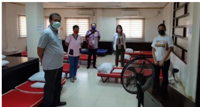
Two (2) vacant rooms at the DTI-O2 NERBAC Building converted into temporary dormitory with provision of beds