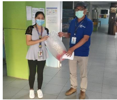
Second DROP off of Face Shields at the Cagayan Valley Medical Center