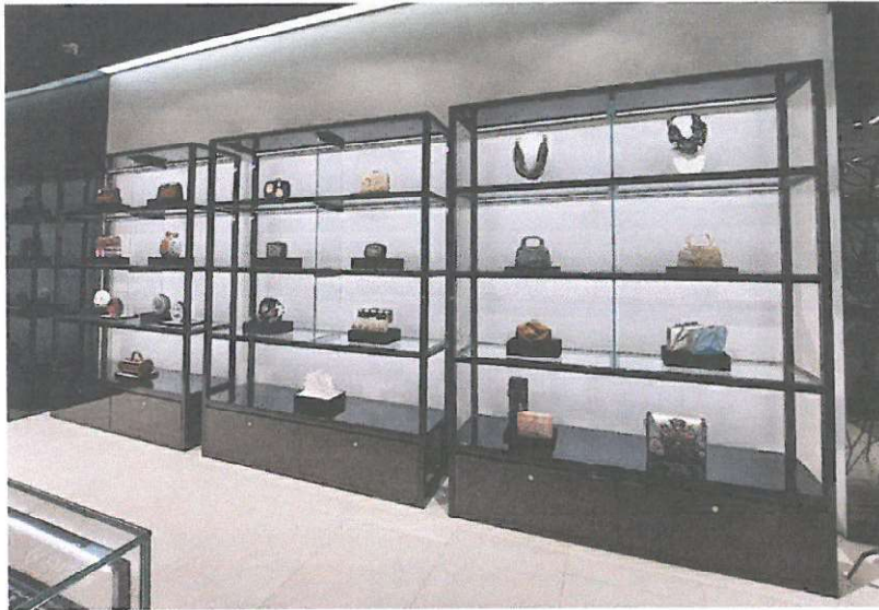
Display Module with Glass Shelves 1827mm x 2400mm x 455mm