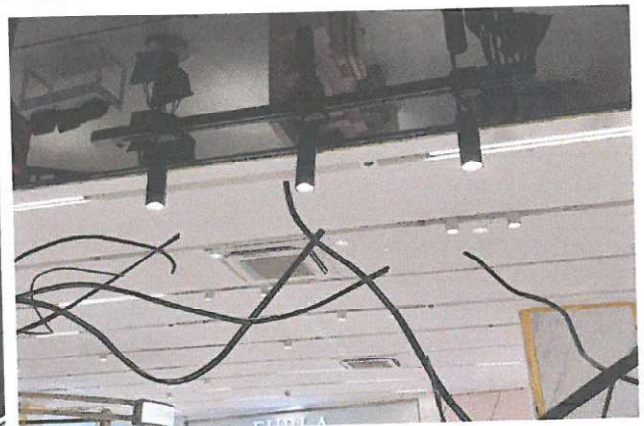
Track bar and lights