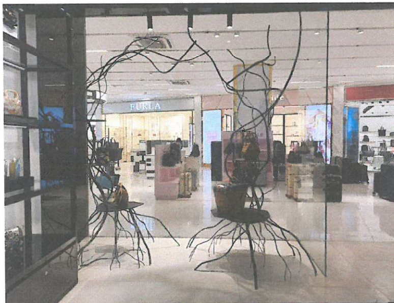
Metal Storefront Props