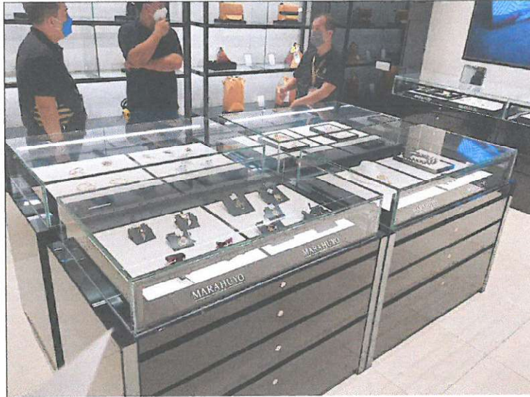
Display Island Case with Glass 1250mm x 1000mm x 700mm