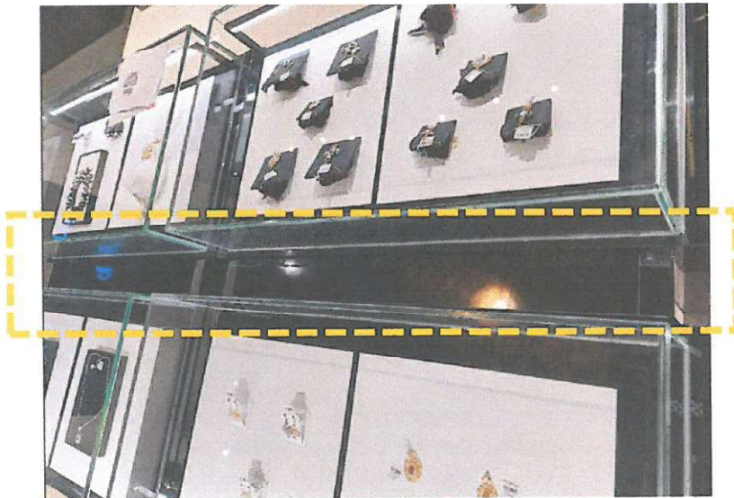
Display Case Island Divider 45 cm (L) x 80 cm (H) x 4 cm (W)