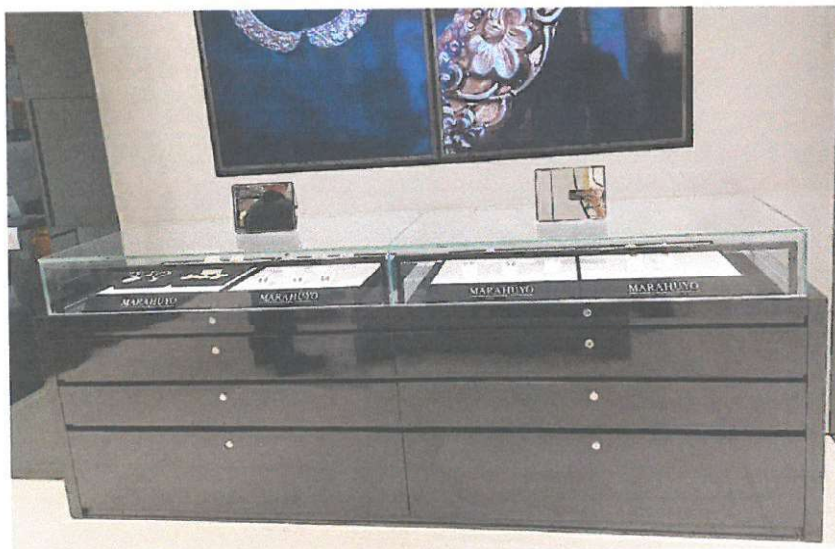
Display Case with Glass 2636mm x 1003mm x 700mm