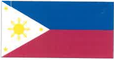
Philippines (Flag/Table Flag)