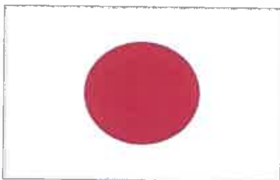
Japan (Flag/Table Flag)