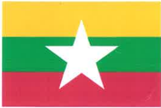
Myanmar (Flag/Table Flag)