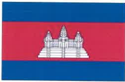
Cambodia (Flag/Table Flag)