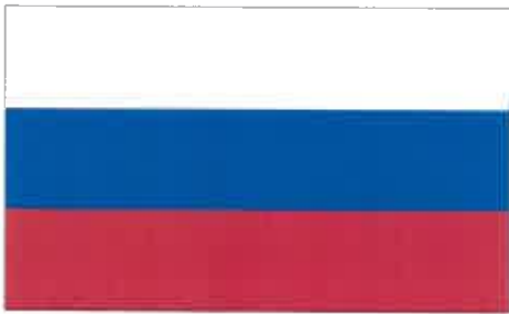
Russia (Flag/Table Flag)