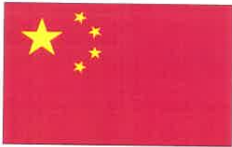
China (Flag/Table Flag)