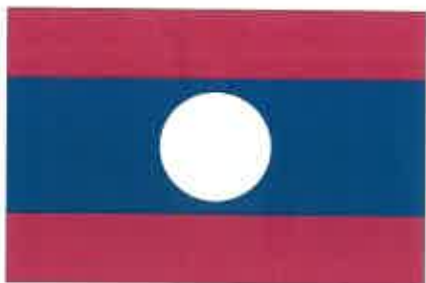
Lao PDR (Flag/Table Flag)