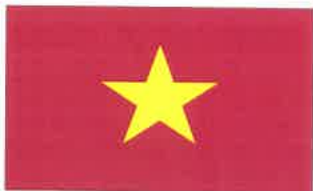
Vietnam (Flag/Table Flag)