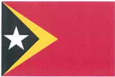
Timor-Leste (Flag/Table Flag)