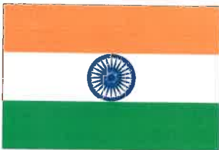
India (Flag/Table Flag)