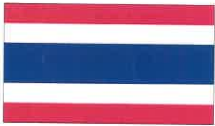
Thailand (Flag/Table Flag)