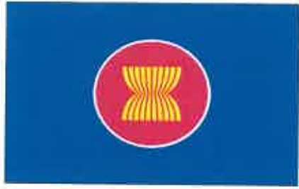
ASEAN Secretariat (Flag/Table Flag)