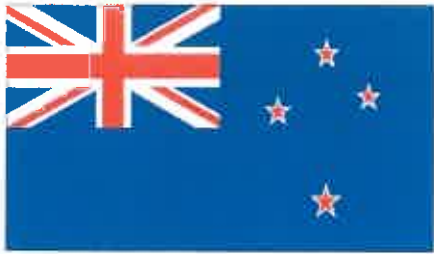
New Zealand (Flag/Table Flag)