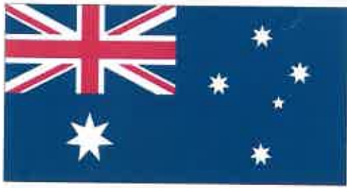
Australia (Flag/Table Flag)