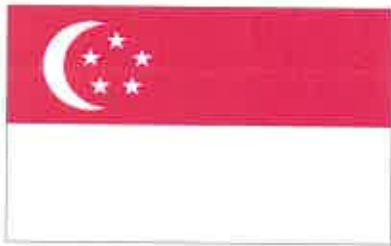
Singapore (Flag/Table Flag)