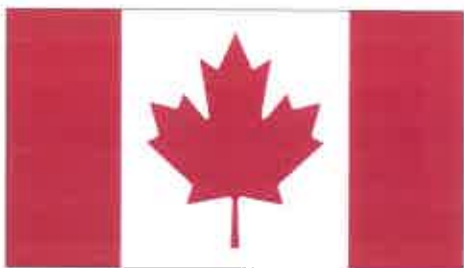
Canada (Flag/Table Flag)