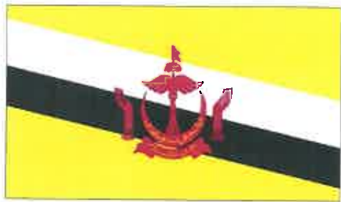
Brunei Darussalam (Flag/Table Flag)