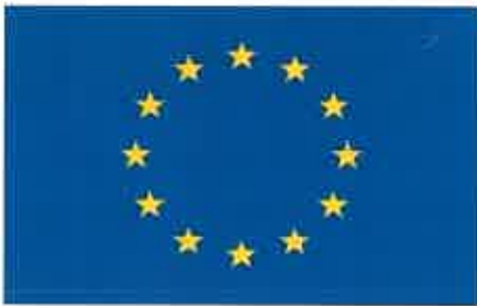
European Union (Flag/Table Flag)