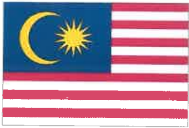
Malaysia (Flag/Table Flag)