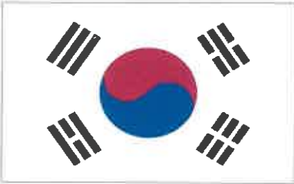
Republic of Korea (Flag/Table Flag)