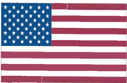
USA (Flag/Table Flag)