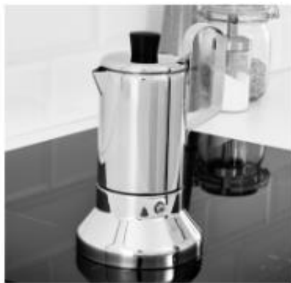
METALLISK espresso maker for hob 0.4 l

IKEA is recalling METALLISK espresso maker for hob 0.4 l with the stainless steel safety valve, date stamps between 2040 and 2204, as the product can burst during use